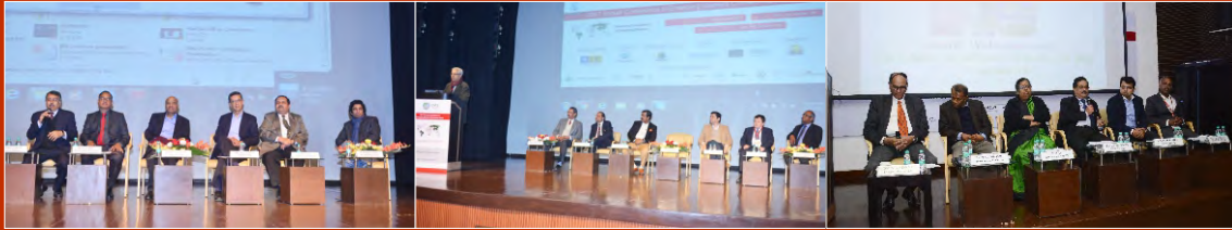
Important plenary sessions in 2017 Annual conference